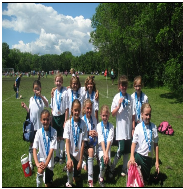
2011 Spring Recreational Soccer registration will be opening in Janu-

ary 2011. With the start of the new year, we at Northern Lights Soccer Club are excited with all of the changes that will be taking place. The recreational program will again receive new uniforms as we know that the children love new things! We are also offering our winter training programs to our recreational players. Please visit our website for information and registration links. Northern Lights Soccer Club's recreational program is always looking for more HELP as well as